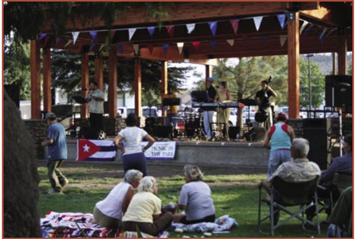
Picnic in the Park brings out friends, families, people-watchers and... picnics!

The Arts Committee of the Crook County Foundation continued efforts in 2006-07 to develop an annual schedule of music and arts programming for the community. The third Picnic in the Park series debuted this summer in the new Pioneer Park Amphitheater, and a new winter concert series, Ochoco Nights, was launched in February.